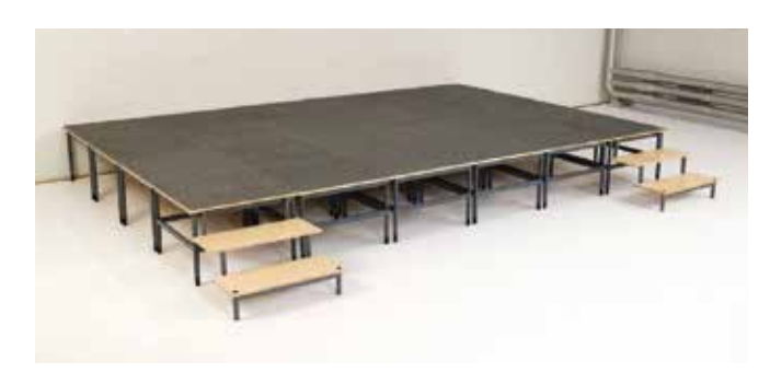
Flat layout (carpeted)

The carpeted kit shown below demonstrates a variety of layouts achievable. The kits include a combination of 277.5mm and 500mm high frames, which enable multi-level and flat stages.